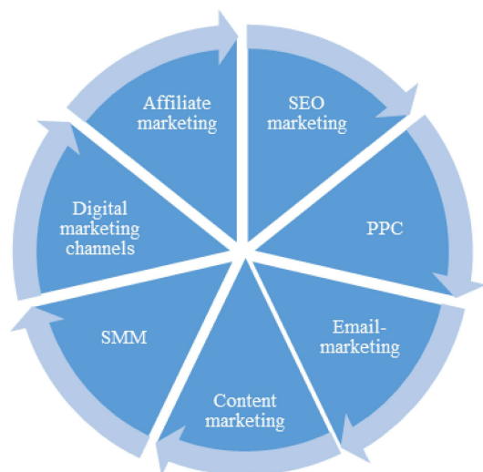
Figure 3. Structure of digital marketing

Thus, it can be argued that in the conditions of intensive digitization of the marketing sphere, business entities should focus on applying the most optimal pricing strategies to ensure increased competitiveness and meet the needs of the modern market. Such strategies include the following: