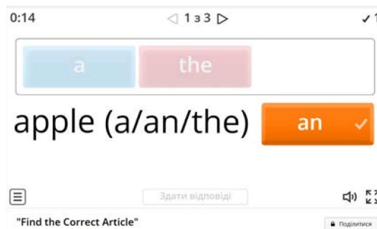
Fig. 5. "Find the Correct Article" game, created using the Wordwall platform

This game will help students practice the topic of the articles “a/an” and “the” in English through an interactive and exciting way, making the learning process more effective and interesting.