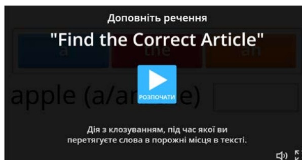
Fig. 4. “ Find the Correct Article ” game, created using the Wordwall platform

Rules of the game: The teacher needs to create a game on the Wordwall , where a noun will be given at each stage. Students must choose the correct article (“a/an” or “the”) for this noun. If the answer is correct, the student receives a certain number of points. The player with the most points wins the game (Fig. 4–5).