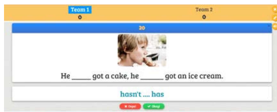
Fig. 2. “Have got/Has got Quiz” prepared using the Baamboozle platform